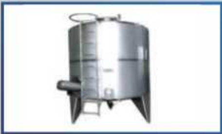
Ghee Storage Tanks