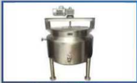
Ghee Boiler Machines