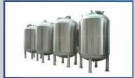
SS Storage Tank