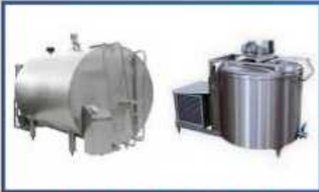
Bulk Milk Cooler (B.M.C)