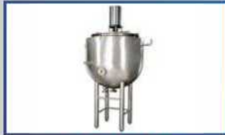
Ghee Boiler / Kettle