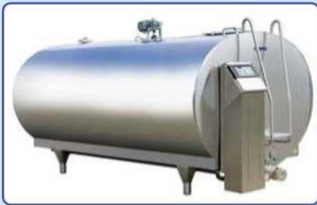
Bulk Milk Cooler

We have one more branch at Tamilnadu State in 2012 at Kakapalayam, Salem Dt. We have complete manufacturing unit of SS milk tankers, Fabrication and repair works, SS-MS Chemical plant and all dairy product plant with expertise. We have huge client base in Tamilnadu as well as in Maharashtra and we are well known in brand in both the states