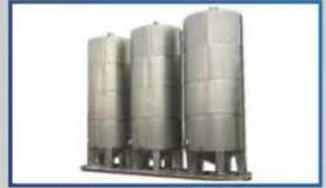
Milk Storage Tank (Silo)