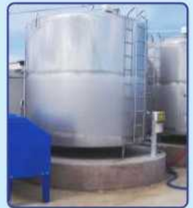
Milk Storage Tank Silo