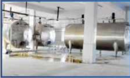
Horizontal Milk Storage Tanks