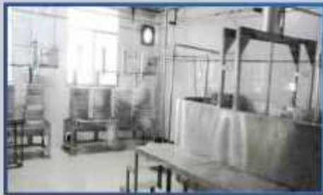
Paneer Processing Equipments