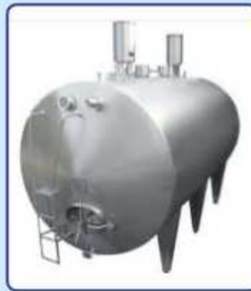
Milk Storage Tank