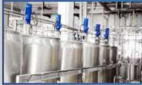
Triple Jacket Vessels